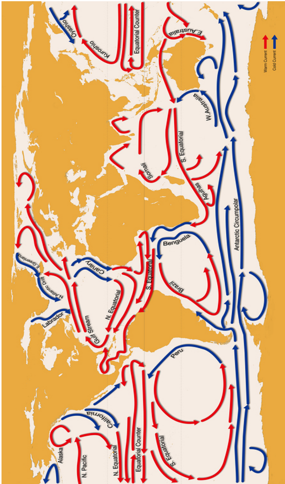
Map of Ocean Currents